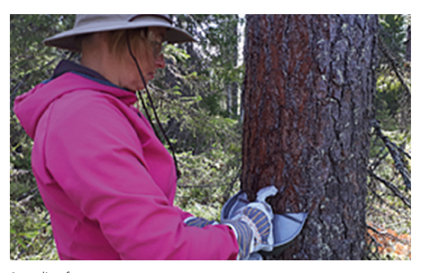
Sampling from trees

www.kaivosvastuu.fi/network-approves-new-standard-forsustainable-exploration/