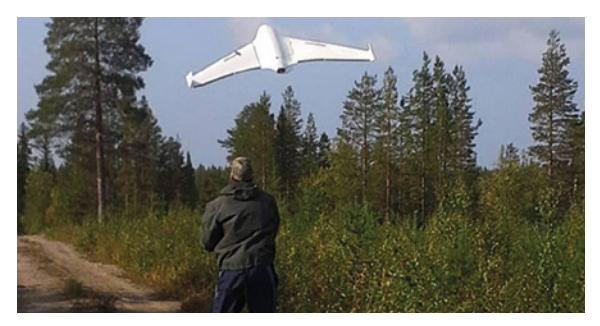
Geophysical surveys by drones